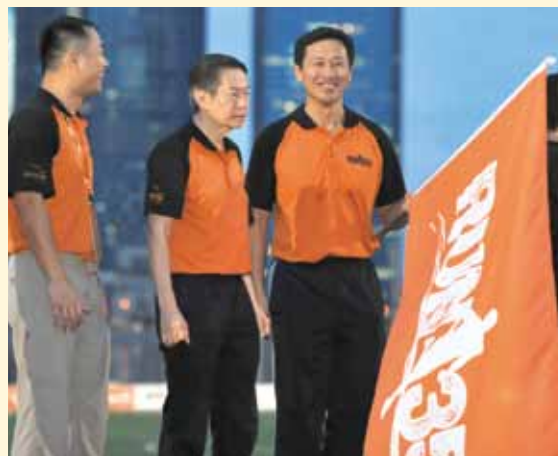
NTUC Deputy Secretary-General Ong Ye Kung (holding flag) gets ready to flag off the race.

"In fact, it's at 392ppm today, and I don't think that ever in human history have we lived with that kind of carbon intensity. The signs out there, people are debating, whether this is desirable or not but I think it doesn't matter. What is important is that people believe that if you want